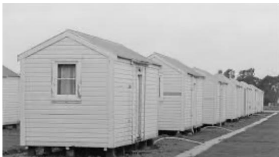
Photo below: What a beautiful view that will be taken away if the Christchurch Act Club goes ahead..